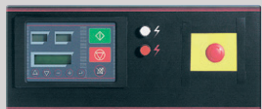
Gardner Denver's advanced DigiPilot user interface